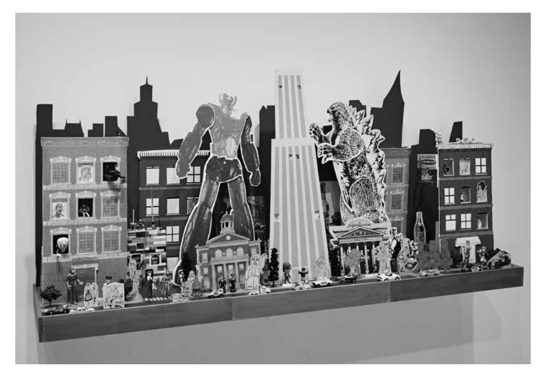
Noah Sherbin A City Scene Screen print and digital print on various papers and foams, found toys, and mixed media