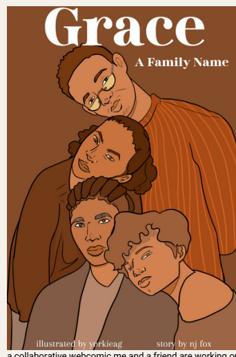
a collaborative webcomic me and a friend are working on